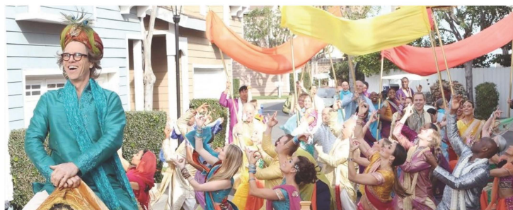
ABC TV: The Neighbors, Episodes Season 2; Ep217 Balle Balle!

Guests ride horse and dance their way to the wedding to surprise the groom