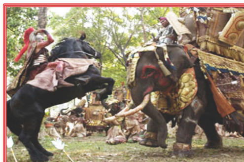
Alexander (left) on his horse battling against the Indian king, Purosottam (right) mounted on his elephant at the Battle of Jhelum in 327 BC

During his invasion, Alexander had encountered a stiff resistance at the Battle of Jhelum by the Indian king named Porus, who used elephants to overpower horses. Further, the incessant trumpets of wild elephants caused confounded horses to run in disarray and the Greek army eventually retreated from India. To honor the heroics of King Porus, patriotic Indians prefer to ride decorated elephants in their Baarat.