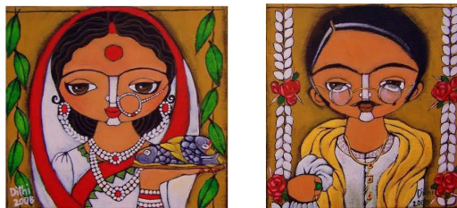
Two Perfect Strangers about to Marry and Live Happily Ever After